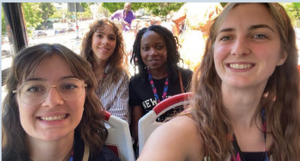
Socialising and networking