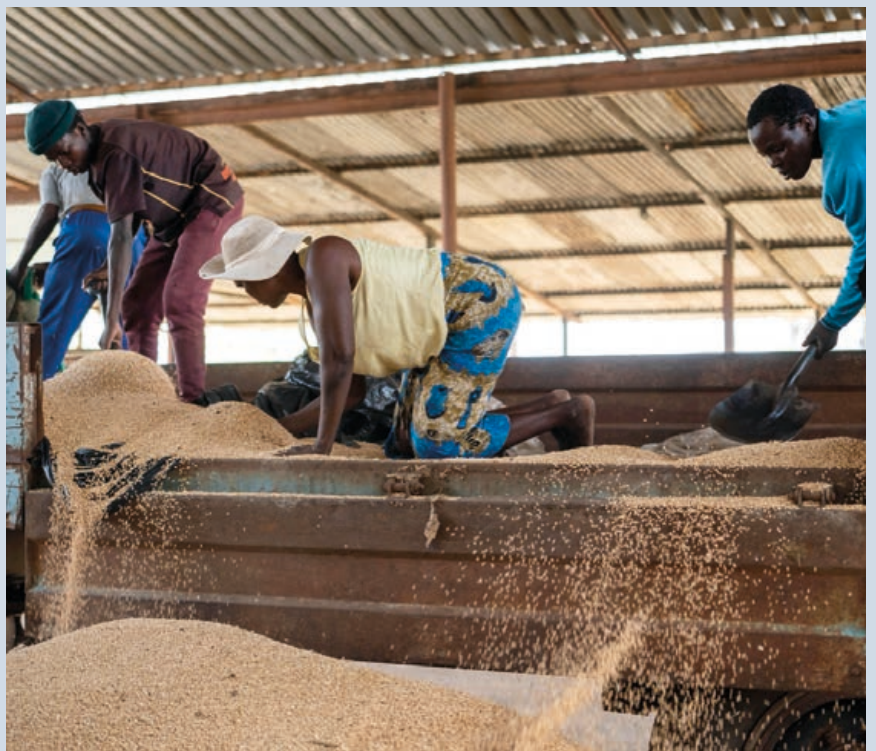
Zimbabwe's economy is still primarily agrarian, with most of the population dependent on farming for a living.