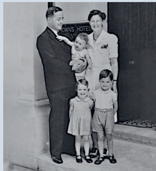
The author's father was the manager of one of London's most prestigious hotels.

For more information about the event, please visit the website: newhelveticsociety.org.uk