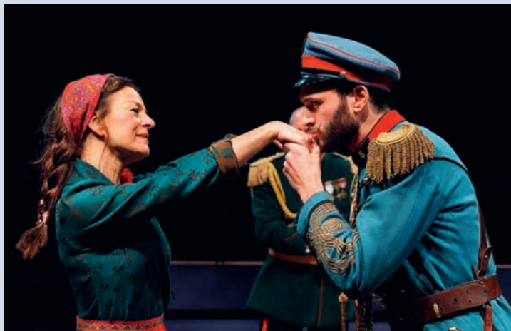
'Arms and the Man' at the Orange Tree theatre.

This famous personality who was born in Dublin in 1856 finally found commercial success with this play written around 9 years later. It is a comedy of social satire, bordering on farce, set during the Bulgarian-Serbian war around 1885 written by a man who was not only alive at the time but was committed to socialism and anti-war beliefs. One of the main protagonists is Captain Buntschli, a very pragmatic Swiss professional soldier who apparently when questioned, confessed he joined the Serbian Army because 'it was the nearest'. The Serbs are defeated and Buntschli is seen on the run and seeking sanctuary in our young heroine's bedroom who, after some hesitation, hides him under a large fur on her bed. He admits to being hungry and asks for chocolates and then devours several chocolate creams. Claiming to be a very experienced soldier and prefers to carry chocolates in his uniform pocket since they are more valuable than bullets. This astounds the young lady since her suitor, Sergius, is a swaggering cavalry Major. He is quite the opposite of Buntschli seemingly inspired by the glory of war and death and romantic love whose feelings are mirrored by his lover Raina as well.