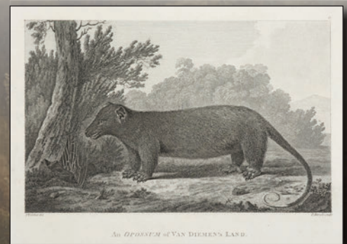
John Webber: Sketch of a possum, Tasmania, 1777. State Library of Tasmania

Sources: Museum of New Zealand; Dictionary of Canadian Biography