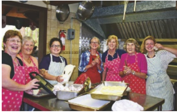
Photo left: over 70 children attended the "Lampion Umzug" at the Swiss National Day celebration on July 28, 2018 Photo right: one of the many happy and hard working volunteer teams the Swiss Canadian Mountain Range Chalet could not do without!