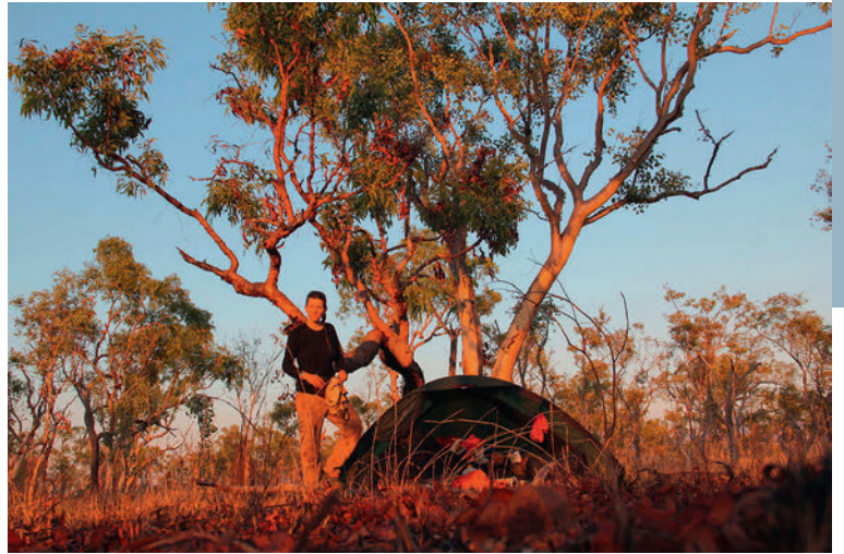
Northern Australia, day 836. I was overjoyed to be back in the bush, where every plant, every tree, every noise was familiar. But I would still need to pay attention to everything around me, as the bush holds constant danger from unseen threats such as crocodiles, bison and snakes.

High Sierra – California I experienced my first mountain scare, narrowly escaping an avalanche up North. I had to wait six days at the top, before being able to finally get down, one morning at 3 am when the snow was hard enough.