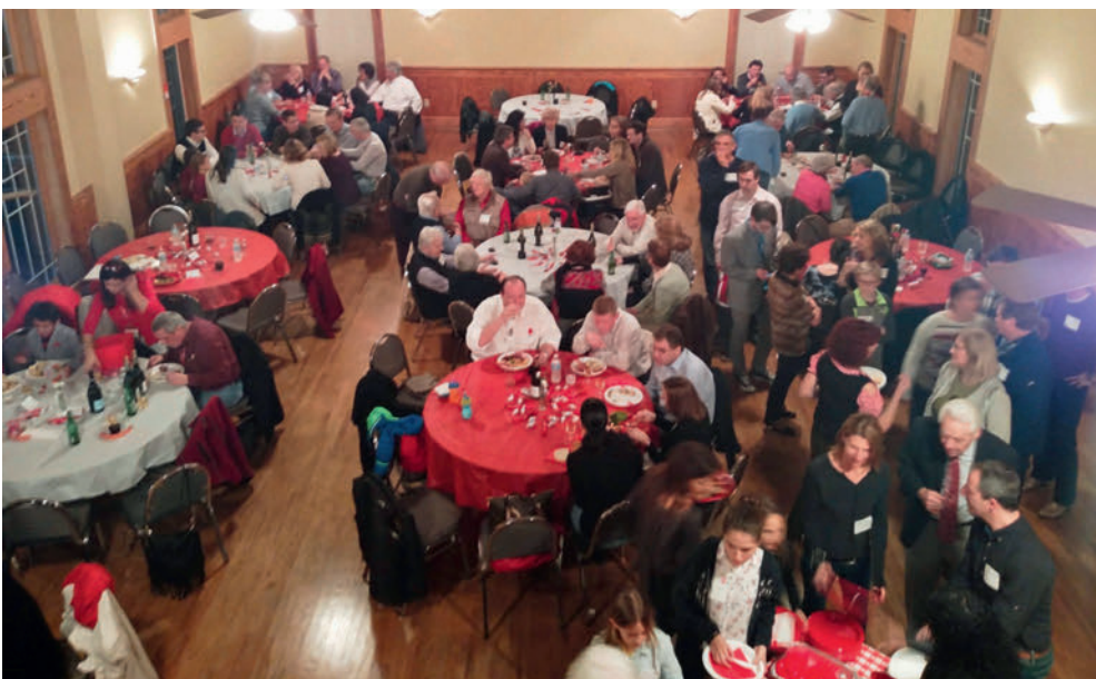
Attendance at the 2016 Raclette evening in Charlotte surpassed all expectations