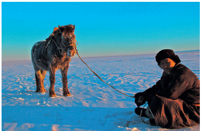
Gobi desert, winter. It was the end of the day, the temperature had dropped to -30^{\circ}\text{C} ( -22^{\circ}\text{F} ), and I was getting ready to put up my tent. This horseman appeared from nowhere, sat down and lit a cigarette, all in total silence. Once he'd finished he nodded to me and left, soon consumed by the whirling snow.