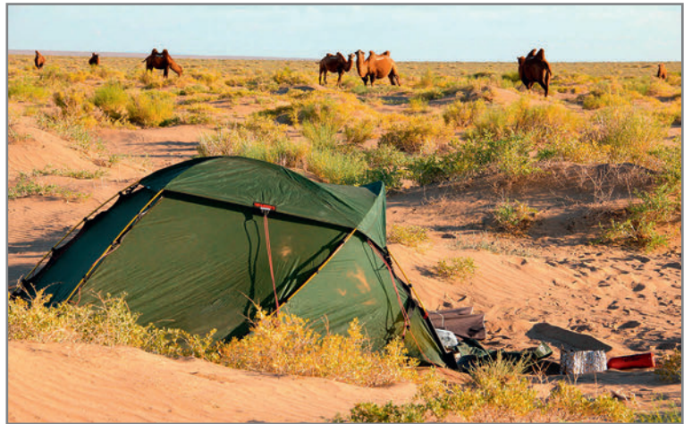
Northern Gobi Desert. I was getting dressed this morning when I heard small, high-pitched, plaintive sounds outside my tent. I silently opened it and saw camels approaching, grazing on the sharp grass. They passed a few metres from my tent. I felt so close to Nature at that time.