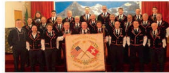
Männerchor Edelweiss - Your Hosts