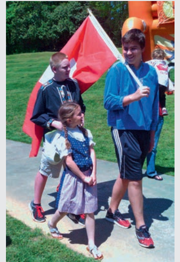
The next generation at the world parade

On behalf of the Board of the Swiss Society of Charlotte