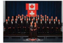
Edmonton Swiss Men's Choir