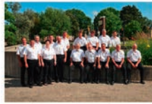
Wildrose Yodel Club