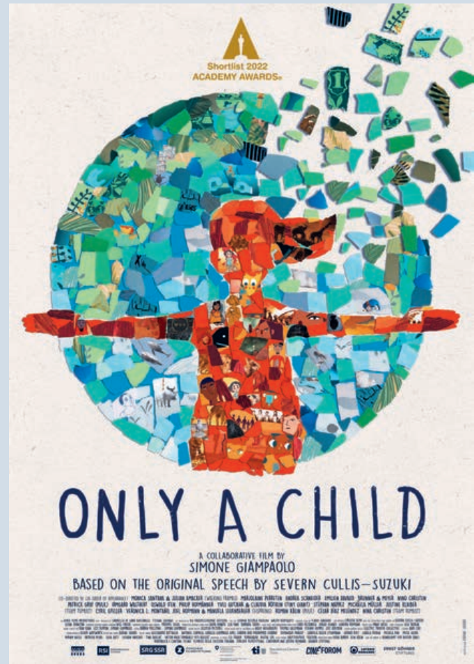
An Oscar-shortlisted animated movie.

While watching our film, you'll soon realise that Only a Child is an incredibly eclectic visual project that displays almost every animation technique in the book: stop-frame, traditional 2D, CGI, clay, puppets, paint-on-glass, sand... You name it! Since day one, I've insisted on portraying as many styles as possible for one simple reason: I see each animation technique as a 'tribe' (or 'nation'), and really wanted Only a Child to metaphorically symbolize different nations – and therefore different human beings – coming together to share a common, crucial message.