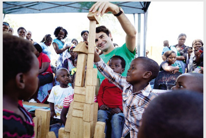
14000 children in South Africa alone benefit from the Federer Foundation.