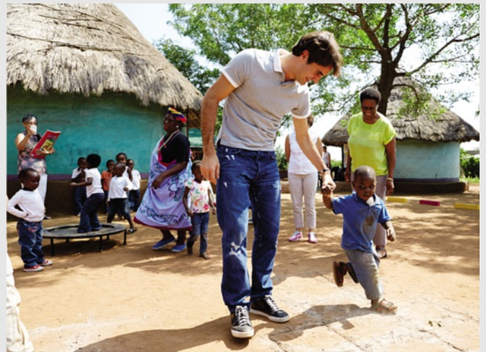
After being absent for eight years Federer finally returned to South Africa again for a visit.

The aim of the Trust is to promote good quality education in 40 crèches for children between 4-6 years old situated in rural and remote areas in Northern Limpopo. During his visit Roger learned all about the current curriculum and saw for himself the children's daily activities.