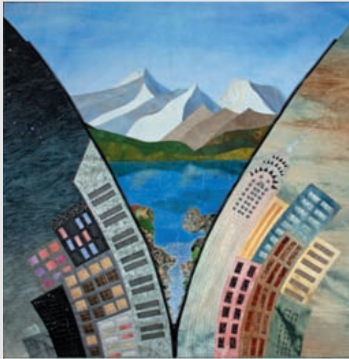
Daily Devotional - an inspiration combining New York and Switzerland

Growing up in Switzerland, one of my earliest memories was of my grandmother patiently teaching me how to sew. This early passion for all things hand-made later led me to practice pottery and attend design classes at Parson's School of Design in New York City. I love nature and studied Japanese flower arrangement for many years and earned Certificate IV of the Sogetsu School of Ikebana of Tokyo, Japan. Yet, for over two decades, I earned my living as a New York banker until, due to a corporate