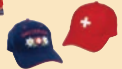
Swiss T-Shirts, Hats, Sweatshirts, and Accessories