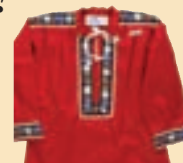
Milking Jackets, Vests, Herdsman Shirts