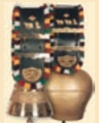
Swiss Cow Bells

Esther's European Imports, 523 First St., New Glarus, WI 53574-0156 • (608) 527-2417