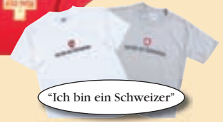
"Ich bin ein Schweizer"