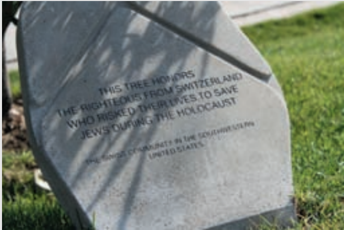
Memorial Stone for Switzerland, placed in the Garden of the Righteous outside the Museum of the Holocaust

CONSUL GENERAL OF SWITZERLAND vertretung@los.rep.admin.ch