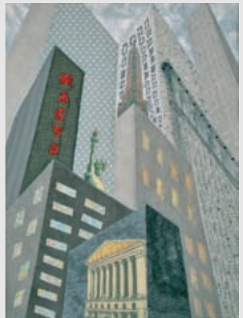
The piece is made of NYSE - New York Stock Exchange

visual tool to separate my lives. On each side are skyscrapers, including Citicorp and the Chrysler Building, and on the upper left in the night sky is the constellation of Cassiopeia outlined with Swarovski crystals best visible in August, my birth month. We live in the NY Catskills where the night skies are brilliant. The center is my "dreamin'" or "daily devotional".