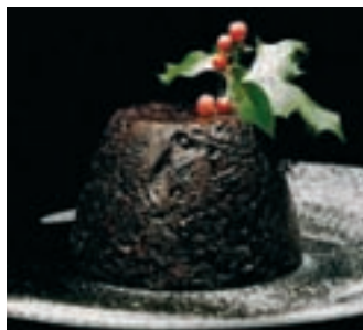
The Mosimann pudding: Today lighter and healthier, but still as tasty

Yoghurt sauce: Mix 200g (8oz) low fat Greek yoghurt with 75ml (5 tbsp) of skimmed milk. Add the juice of half a lemon, together with a pinch of cinnamon and 30ml (2 tbsp) of honey and serve cold.