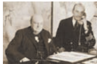
In the bunker: Churchill directing the war from underground headquarters.

Growing intelligence from British agents in Switzerland and Swiss sympathisers clearly showed the strategic importance of the three vital links between the Axis powers. Two of them passed through Switzerland – over the Simplon and the Gothard. The third was the Brenner line from Austria. Churchill's dilemma came to