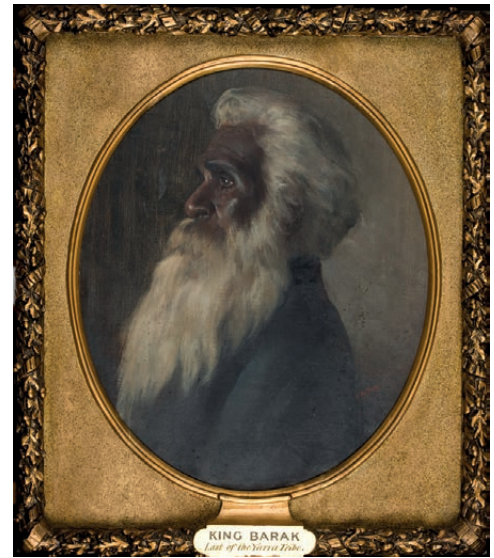
‘King Barak last of the Yarra Tribe’ painted 1899 by Victor de Pury. Oil on canvas