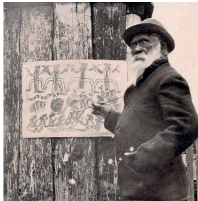
William Barak, the artist