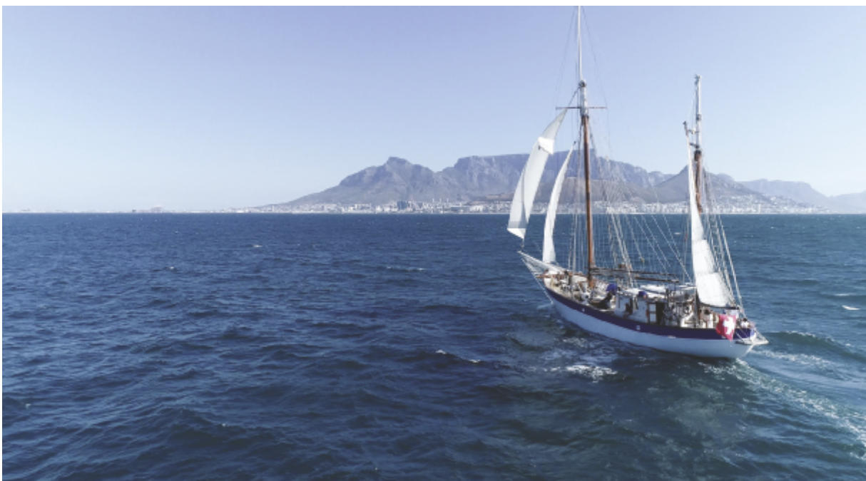
The "Fleur de Passion" arrives in Cape Town.

scientific, educational and cultural programs in order to better understand the human impact on