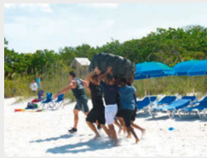
The Marines training at the beach

Our members have had a very busy schedule over the past few months. The annual picnic in June drew a sizeable crowd. While everybody was socializing, a group of Marine recruits was having a pre-boot camp