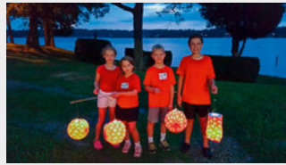
Children ready for the lampion parade

of August National Holiday. Almost 120 people enjoyed the great weather this year, the grilled sausages (St. Galler Olma Bratwurst), Fleischkäse and all