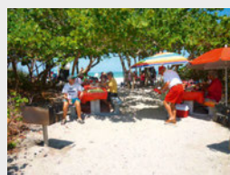
Picnic is serious business!

smell of cooking wafted around. Fortunately the Marine recruit workout was soon over and the tired boys and girls didn't have to smell all the good eats!