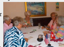
The non-jassers playing UNO

Friday, September 5, was a beautiful day for a visit to the Conservancy of Southwest Florida in Naples. Twenty members and two guests gathered at the entrance. The interesting journey began with a 45-minute ride on an electric boat down the estuary and up a ways on the Gordon River (the major tributary to Naples Bay). The guide explained the function of the Mangrove and their importance to the ecosystem of the river. Protected by law, these plants can only be trimmed with a special permit and under the supervision of a trained specialist. The estuary also provides shelter for the Florida manatees, particularly when the ocean gets too cold for them to survive.