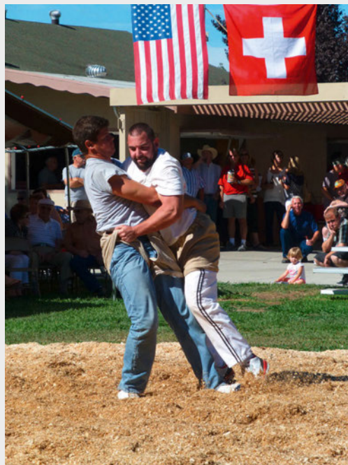
Never too young and never too old for a "Hoselupf"

Schwingfest, San Diego Swiss Club Schwingfest and Aelpler