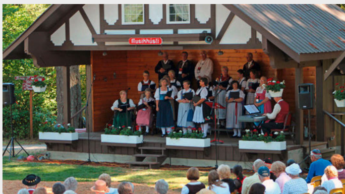
San Joaquin Valley Swiss Echoes performing at the Swiss Park in Bonney Lake