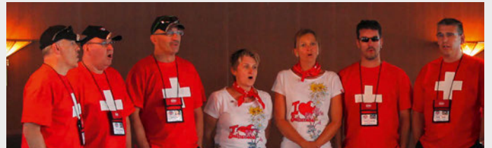
"Chorli" from Beinwil am See, Switzerland