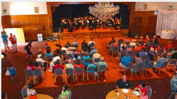
Entertainment was offered in the Matterhorn room and also outside under the large tent

The Swiss Fair attracts between 1800 and 2000 visitors from 11 am to 7 pm each year and is eagerly awaited.