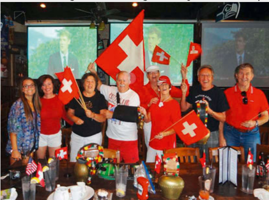
The fan-club in an Irish bar in Scottsdale, Arizona

20 seconds left . . . Switzerland going wild . . . the Alps must have been trembling. That kind of goal in my whole Soccer/Fussball life I