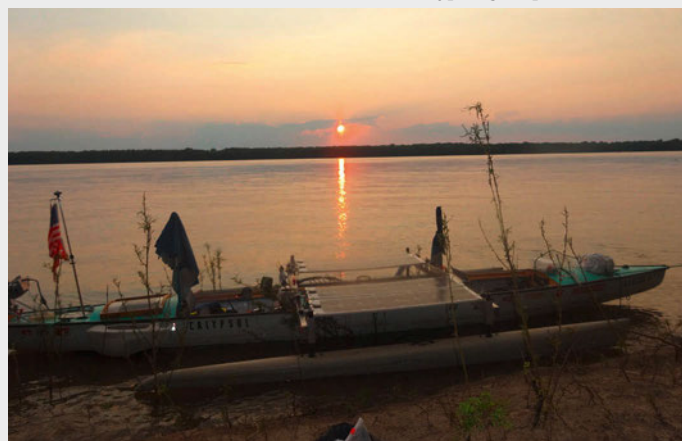
Sunset on the Mississippi, North of Meeman-Shelby Forest State Park, near Memphis, TN