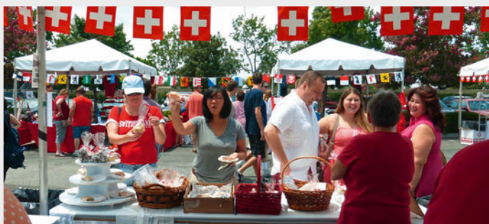
The Swiss Ladies booth doing a brisk business selling home-made desserts