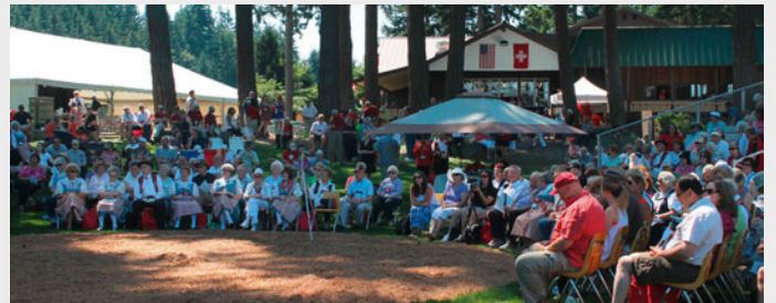
Part of the numerous guests enjoying the performances at Swiss Park