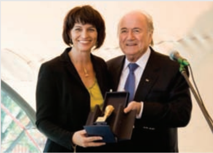
Doris Leuthard and Joseph Blatter

As guest of FIFA, the President of the Swiss Confederation, Doris Leuthard, accompanied by her husband, travelled to South Africa to attend the opening ceremony of the 2010 FIFA Soccer World Cup.