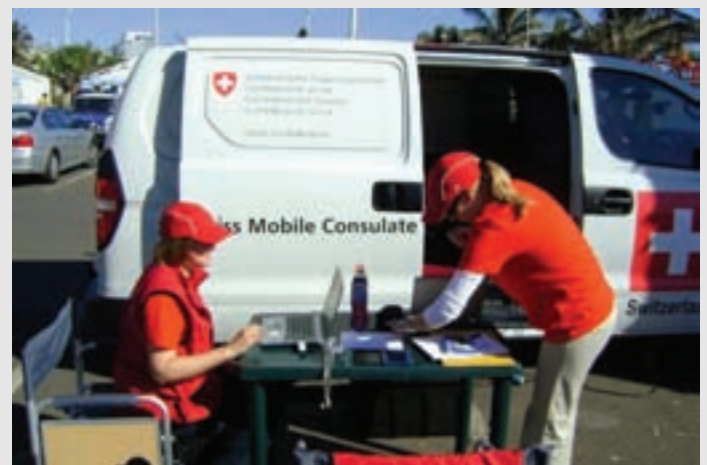
The Swiss Mobile Consulate in action.

Experience the Flamenco soul on the way to ZURICH